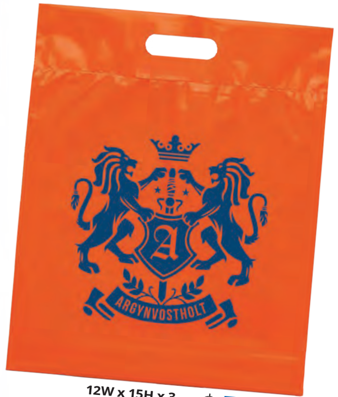
12W x 15H x 3 *Orange available in 12W x 15H x 3 size only. FLE XO INK PRINT