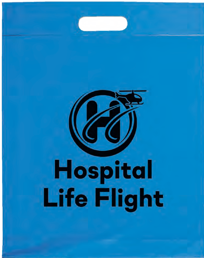
15W x 19H x 3 FLE XO INK PRINT