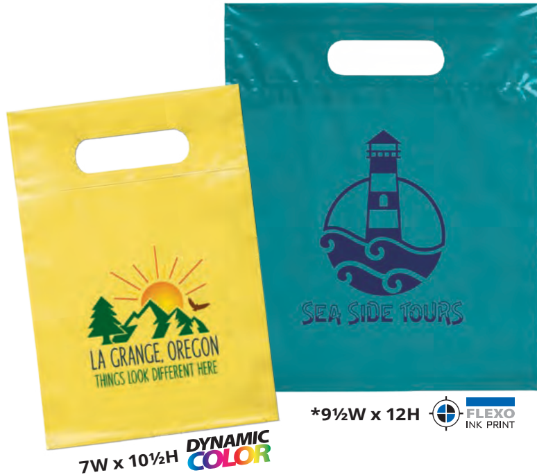
7W x 10½H DYNAMIC COLOR

These 2.5 mil lo-density plastic bags feature fold-over reinforced die cut handles. Bottom gusset is available on select sizes.